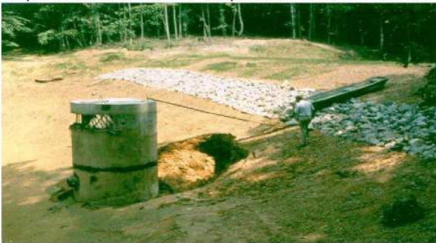
Photo 1: Sinkhole around a spillway riser 2

Conduit inspections are conducted in one of two ways; exterior conduit inspections and interior conduit inspections. Methods for inspecting the various features of a conduit mainly depend on accessibility. Exterior inspections are obviously the most cost-efficient, but rely primarily on secondary indicators of conduit performance and condition. Interior inspections can be difficult to conduct and sometimes require special equipment. For this reason, exterior inspections are typically used as a good screening tool for justifying more costly, but more definitive interior inspections. The following sections describe exterior inspections and interior inspections in more detail.