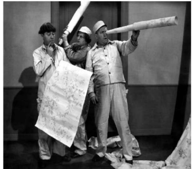
Encourage effective communication between engineer, owner, and contractor

A schedule that defines a frequency for required meetings should be laid out within the specifications. Each construction project should kick off with a Preconstruction Meeting involving the owner, engineer, contractor, key subcontractors, and regulator. The principal features of work should be reviewed and any questions regarding the Contract and work site should be addressed. If the project is particularly specialized, involves high risk activities for workers or the safety of the dam could be compromised during construction, a construction risk meeting should be a part of the Preconstruction Meeting(s). Topics in the risk meeting should include reviewing approaches to high risk components, mitigating measures, and emergency response procedures.