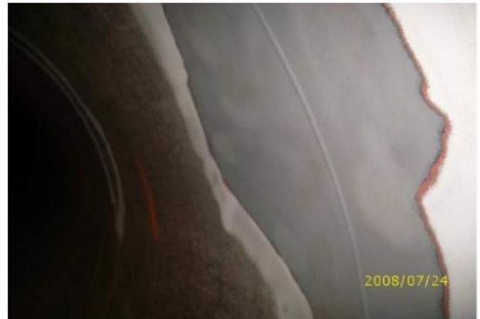
Photo 8: Sandblasted steel surface in preparation for applying new epoxy coating at joints.

The most common metal pipe used today in constructing conduits through embankment dams is steel. Steel pipes are typically used as liners in RCIP conduits. These conduits are typically delivered to the job site with the interior painted from the factory and the exterior bare steel. The pipe is typically set into place and the joints welded together. The factory-applied coating along the interior of the conduit stops about six inches short on either side of the joints (to allow space for welding) and has to be painted in the field after assembly. A reinforced concrete encasement is cast-in-place after the conduit has been water tested and accepted for use.