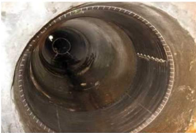
Photo 7: Link-Pipe Grouting Sleeve after installation over cracked conduit.

etc.). Many common mechanical repairs consist of a rubber seal with a stainless steel band that helps to compress the rubber seal against the conduit by expanding the band once in place. It is important that any mechanical repairs implemented within the conduit be tapered at the ends to minimize flow obstruction. Because seepage can sometimes extend away from the conduit, it is important that repairs like these are monitored by regular exterior and interior inspections to ensure no new signs of internal erosion, backwards piping, or seepage into or along the conduit develop.