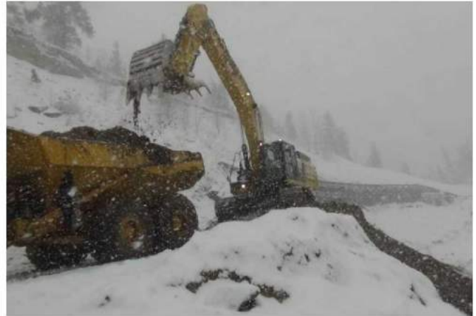
Poor weather can often mean lower quality and higher cost.

freezing temperatures during the initial curing period, and so may require the use of blankets and/or heaters, or accelerants in the mix, during cold weather leading up to winter shutdown.