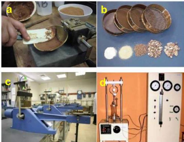
Assortment of soil testing equipment: (a) Atterberg Limits, (b) Sieve Analysis. (c) Consolidation. (d) Triaxial Shear

Different sample types, volumes, and preparation methods are required for different types of laboratory tests. For example, most index property tests can be performed using disturbed samples (commonly obtained using split spoon or modified California samplers, or by hand from an auger flight, spoil pile or test pit). Conversely, if testing of in-situ properties is desired, engineering property testing such as triaxial shear strength, consolidation, collapse, and permeability tests require relatively undisturbed samples, such as obtained from thin-walled samplers. There are exceptions; for example, strength or permeability tests are often performed on remolded samples to enable modeling compacted embankment fill.