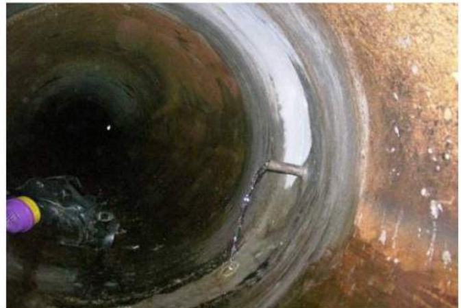
Photo 6: Grouted joint offset with grout port installed for injection grouting behind conduit.

For this method of repair, the opening should be temporarily sealed, creating a bulkhead, so that grout can be injected behind the conduit. Non-shrink grout can be applied from the interior of the conduit to develop the bulkhead and grout injection ports can be installed through the grout, around the circumference of the crack, at a spacing that will allow the grout to fill any voids that may have developed. Generally, grout injection behind the conduit should be completed so that the injection pressures do not exceed about half the lateral earth pressure of the embankment at the location of the crack.