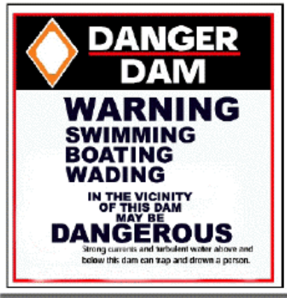
Vinyl or Paper Signs