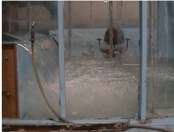
Figure 3 – Photo of physical model from comparison 2