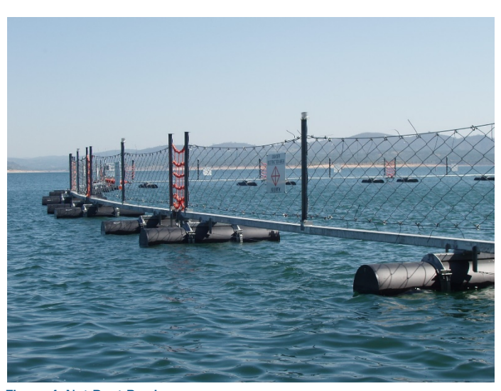
Figure 4: Net Boat Barrier