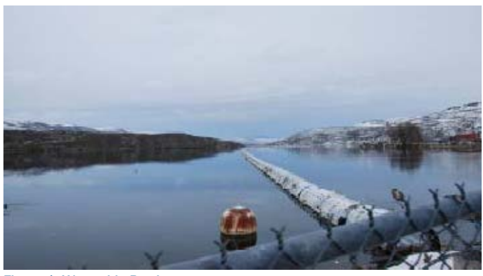
Figure 1: Waterside Barrier

Waterside markers put in place as part of a dam safety program to demarcate dangerous areas and warn swimmers and boaters of the dangers of proceeding farther are not the topic of this brochure.