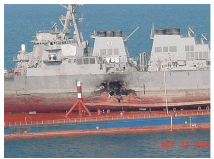
Figure 2: Boat Attack on USS Cole

Water-based attacks from World War II to the present day have featured combat swimmers (unaided or with vehicle support), small boats, mini-submarines, and large vessels relying on kinetic energy or explosives or both. The October 2000 attack on the USS Cole, during a refueling stop in Yemen, was an obvious waterside attack. The US Navy, before and since the Cole incident depicted in Figure 2, developed capabilities for control of water-based access to its high-value assets.