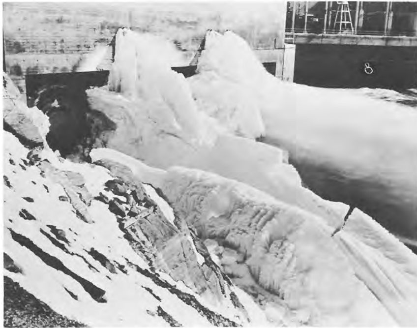
Closeup view of Hungry Horse outlet works showing ice buildup resulting from operation of the three 96-inch hollow-jet valves - No. 3 jet valve is still operating. March 23, 1965.