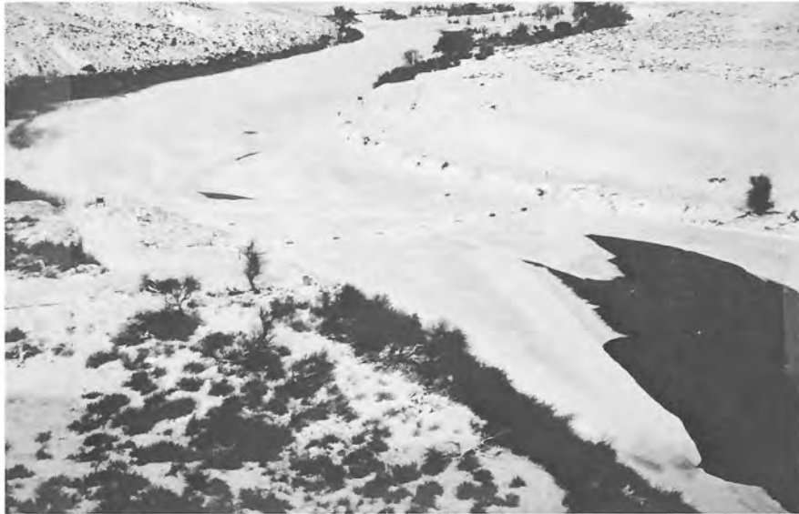
Log boom - North Platte River - North Platte Project - Wyoming. Panoramic view of log boom. January 4, 1971. Photo C20-703-1207