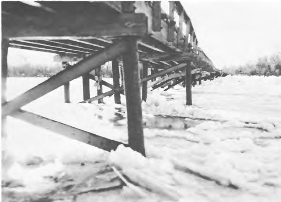
View showing stringers of Ervine Bridge on North Platte River, some broken by the ice. Upstream side of bridge. January 4, 1967. Photo P20-703-5715NA