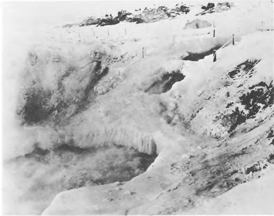
Ice in Pilot Butte Wasteway. January 26, 1949. Photo A-191