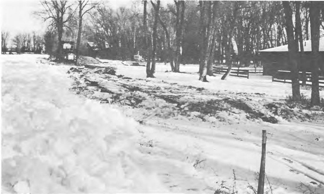
View looking upstream on the Gunnison River adjacent to the Dos Rios Homesites. Note the emergency dikes being placed to contain water forced out of channel by ice. January 8, 1971. Photo P622-D-68761NA