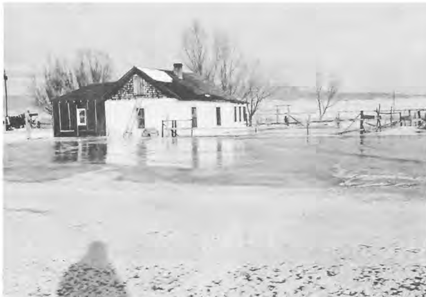
Missouri River flooding condition - Head of Canyon Ferry Reservoir near Townsend, Montana. November 18, 1959.

Ice jams forming on the Missouri River in the Townsend area have been a serious problem for many years. This problem has allegedly resulted from the impoundment of water in Canyon Ferry Reservoir. The winter of 1959-1960 seemed to be particularly severe with ice jams and resulting flooding in November and December. In November several head of cattle were lost and flooding of property adjacent to the river resulted in bitter feelings between residents of Townsend, Montana, and the Bureau of Reclamation.