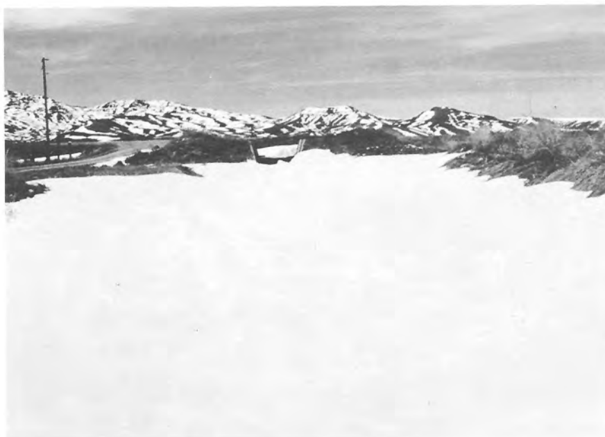
Ralston Chute plugged with snow and ice. Photo PX-D-68694