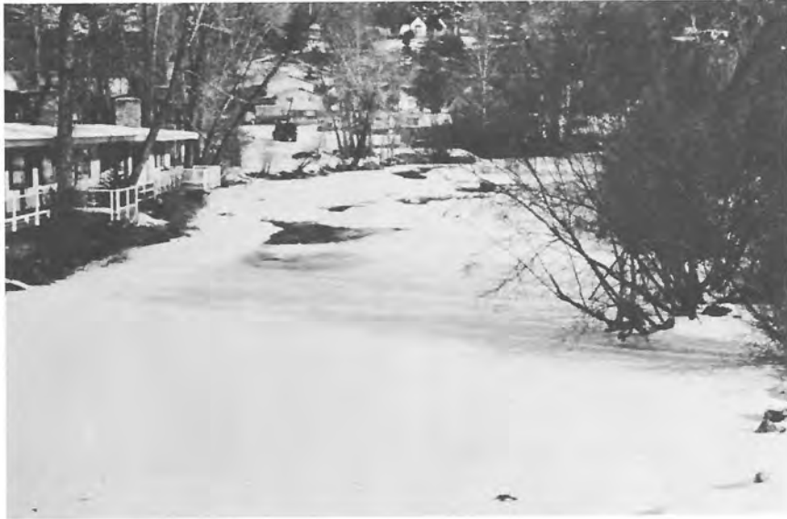
Ice buildup on Fryingspan River in Basalt, Colorado. January 13, 1970. Photo C382-706-401NA