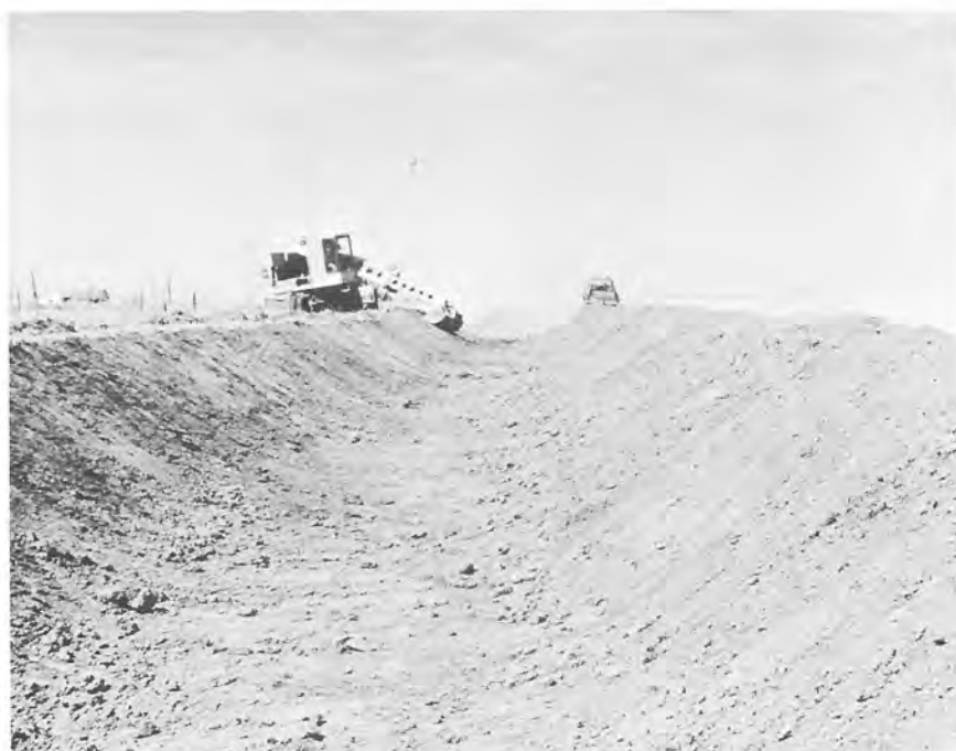
Typical truck-mounted, hydraulically operated excavating machine. Photo P257-D-47911

protruding from the banks of the canal. The truck moves along the canal at a moderate speed while an operator on the truck maneuvers the buckets of the machine so as to break off any shore ice. The object is to keep the ice moving. If it stops it would soon jam the whole channel cross section. At times they use light charges of explosives (1/4 sticks) to keep ice moving.