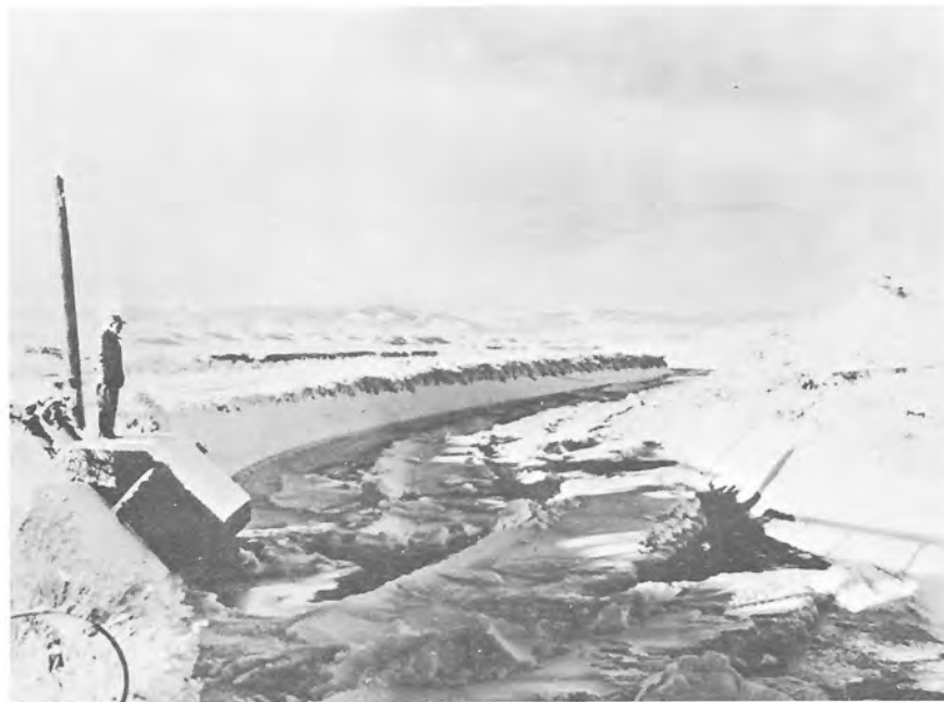
Ice condition, intake Midwest Siphon. December 27, 1948. Photo A-232