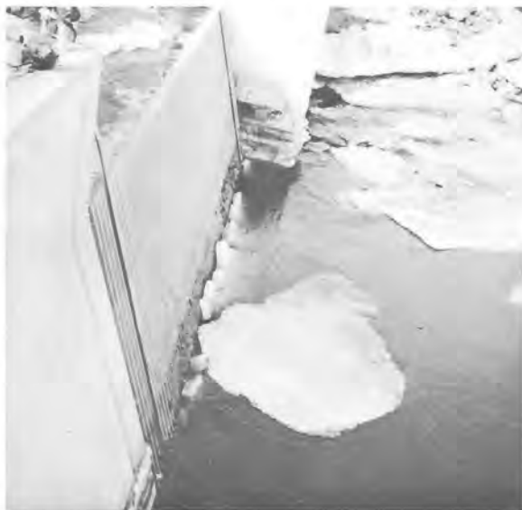
Floating ice against the trashracks. Note how the ice slabs have turned and flattened against the rack, greatly reducing the intake cross section. February 4, 1970.

They have found that by maintaining the water surface as high as possible they can develop an ice cover high enough that the effective flow area of the trashrack is much improved over that at a lower water-surface elevation.