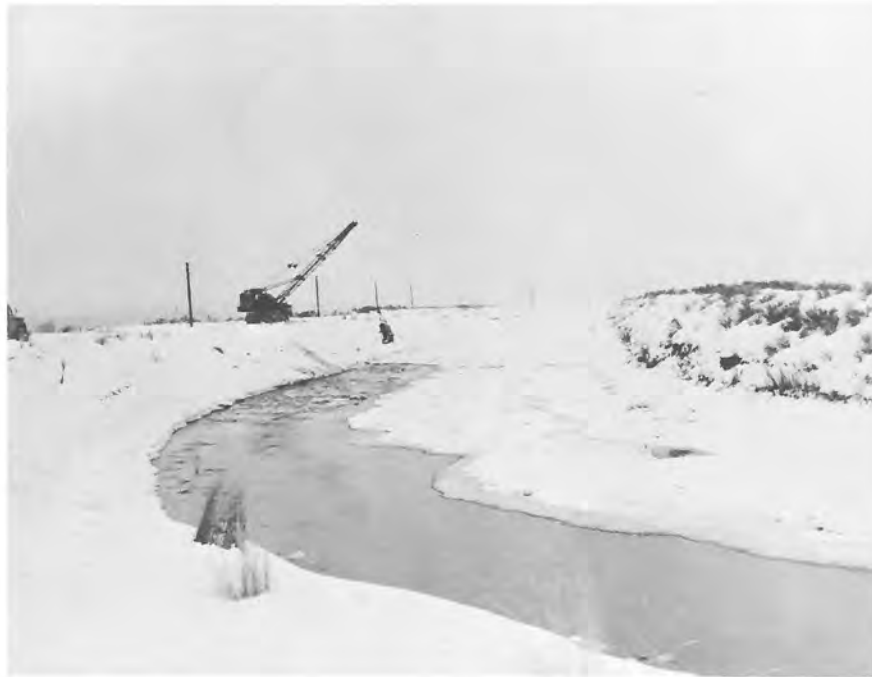
Roza I. D. breaking ice in Roza Canal at Mile 8, preparatory to starting Roza powerplant generator. Dragline can reach only half width of canal. January 11, 1965.

Trashracks are used with three single-phase transformers which vibrate the racks to remove anchor ice.