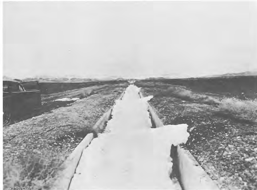
Ralston Chute plugged with snow and ice. Photo SP394

The project personnel also mentioned a safety problem as a result of ice accumulations on the Buffalo Bill Dam abutments resulting from seepage through the abutments.