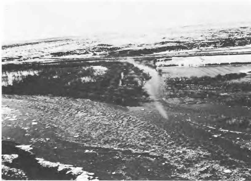
Floodwaters move swiftly down the Yellowstone River following release of an ice jam downstream from the Lower Yellowstone Diversion Dam. Note turbulent flow. February 16, 1971. Photo A14-600-34NA