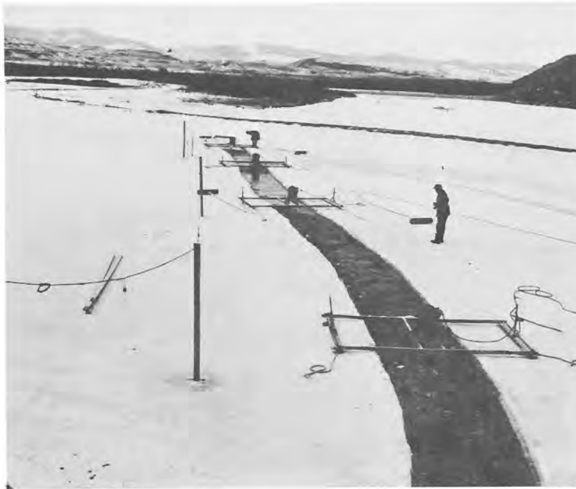
View looking upstream at channel cut in ice at the Wind River Diversion Dam. Four outboard motors and propellers have been placed in the channel to divert slush ice over the dam, thus preventing entry of ice into power canal. December 14, 1967. Photo P36-703-23NA

The Wyoming Canal is kept checked-up to form an ice cover. The problems arise when a Chinook wind warms the air temperature, thus breaking up the ice cover. When this occurs, the canal siphons can become ice choked.