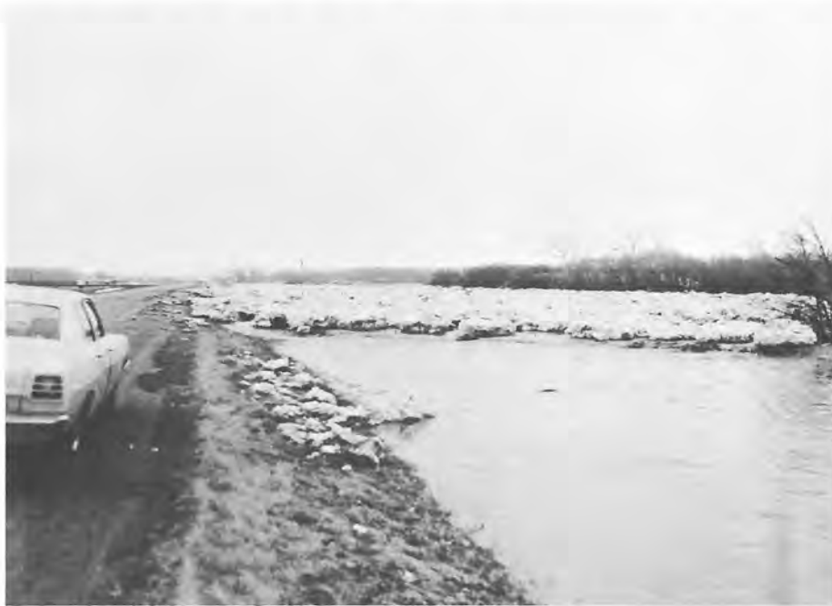
View looking west along old U.S. Highway No. 10 west of Mandan, North Dakota. The water had receded about 1 foot at the time photo was taken. Note the ice blocks. April 4, 1969. Photo P1112-603-76NA

The spring thaw on the Heart River generally precedes that of the Missouri River by about 2 weeks. The floating ice from the Heart River is prevented from entering the Missouri River by the cover ice of the Missouri. This results in an ice jam on the Heart River at its confluence with the Missouri.