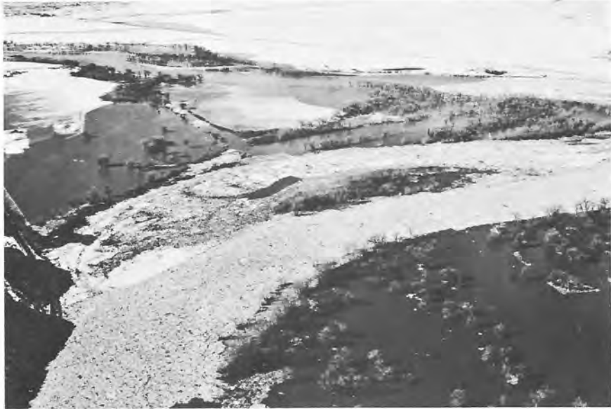
Yellowstone River, Montana - Aerial view looking upstream at an ice jam 8 miles west of Miles City, Montana. Note flooding on both sides of the river channel. February 16, 1971. Photo AX-600-36NA