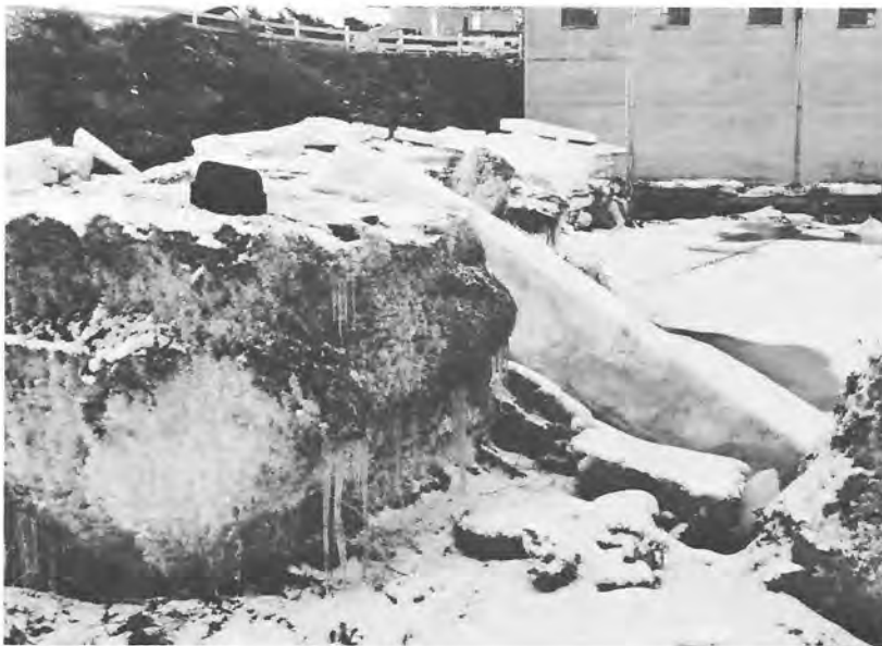
Looking at intake side of pumping plant showing large chunks of ice that were left after flood that occurred February 15, 1971. Note trashracks. March 1, 1971. Photo P243-D-68760