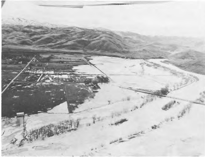
Aerial view of Montour, Idaho area flooding January 10, 1971. Photo P3-162-908NA