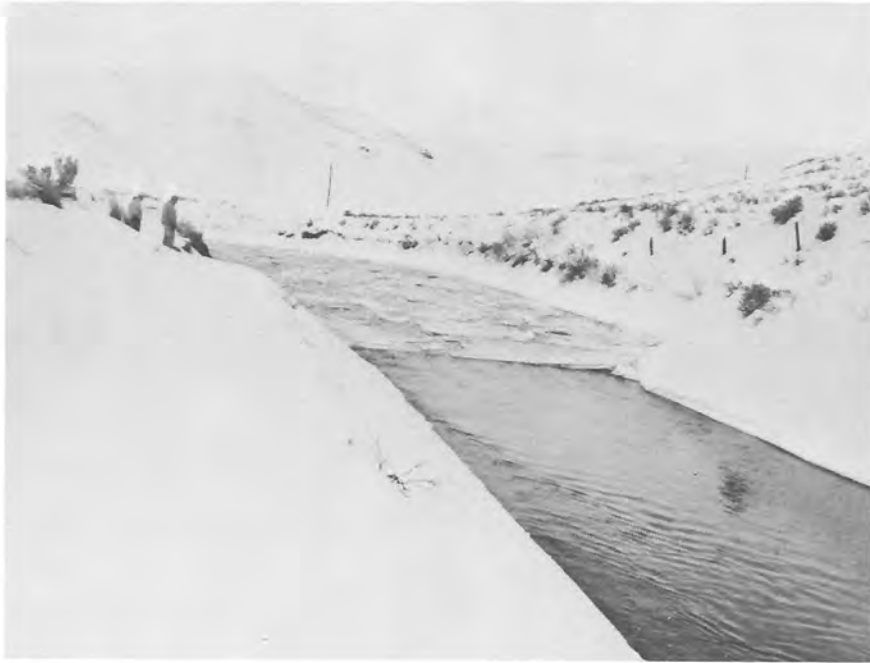
Lower end of ice jam in Roza Canal Mile 8.3, unlined to lined canal transition; flow 300 + cfs. January 7, 1965. Photo P33-109-6960NA