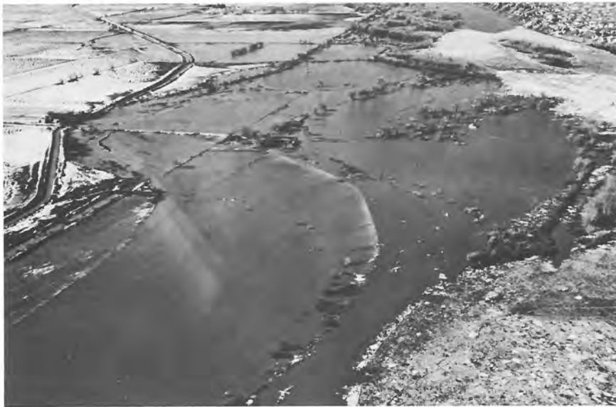
Yellowstone River, Montana - Aerial view looking upstream at flooded farmland and buildings in the Yellowstone Valley near Hysham, Montana. Note ice jam upper right corner of photo. February 16, 1971. Photo AX-600-31NA