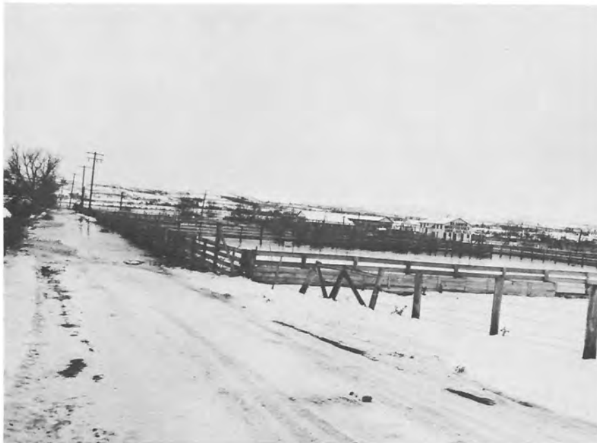
Flood caused by Yakima River ice jam, about 1 mile long, below railroad bridge, East Selah area. Hammon cattle ranch at right. January 7, 1965.