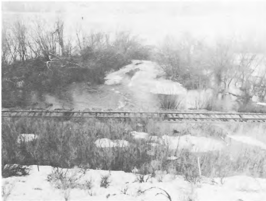
Water flowing through washed-out railroad right-of-way behind the McConnell Ranch January 9, 1971. Photo P3-102-903NA